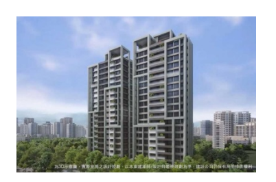
聯上淳 (Sold Out)